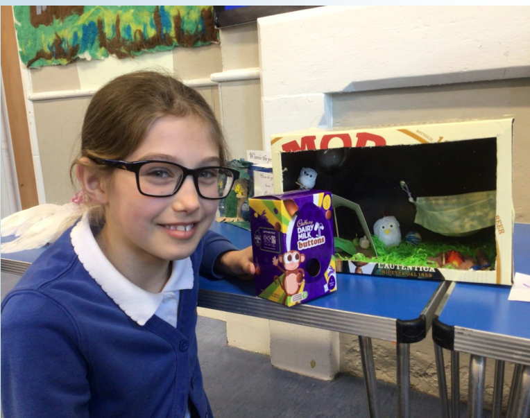
1st place– Poppy